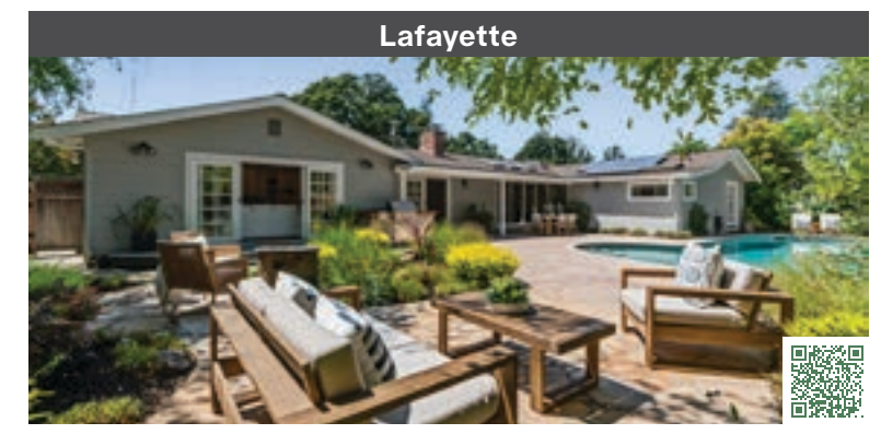
568 Merriewood Dr. NEW PRICE! Now Offered at $2,375,000