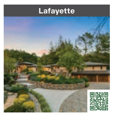
4090 Happy Valley Rd. Offered at $8,995,000