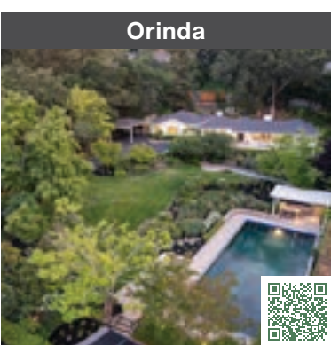
222 Moraga Way Offered at $3,185,000