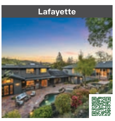
1203 Upper Happy Valley Rd. Offered at $3,977,000