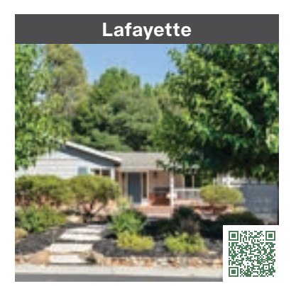
1074 Laurel Dr. Offered at $1,750,000